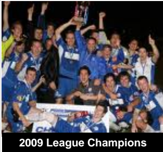
2009 League Champions

He suggested that most Australian bred sports people value a Grand Final win higher than being first past the post and finishing top of the League table. He also said that although it was hard to mount an argument against awarding the title of champions to the most consistent team, he reckoned that the players from Peninsula and Rochedale would swap their CHAMPIONSHIP medals for a Grand Final equivalent.