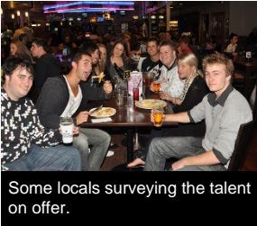
Some locals surveying the talent on offer.

Many of the players are finally wanting to be guest judges at the “ Ms Rochedale Rovers Quest ” ..... now that they have seen the photos!