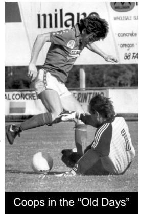
Coops in the "Old Days"

It's funny and you players won't appreciate it until you get older, but the 8 of us 'Old Players" just sit around and talk about the "Old Days". We tell the same stories over and over again and they are still funny. You have it all ahead of you, that's why you should cherish the time you spend as team mates. In 10 or 20 years time you will catch up and talk about things that happened in the dressing rooms, or on the pitch or at a Players Day out and you will laugh your heads off. My advice to you all is simple. Life is to short. Enjoy every moment because when it's over, its over.